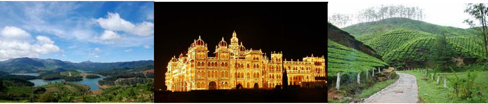
Ooty – Hill Station