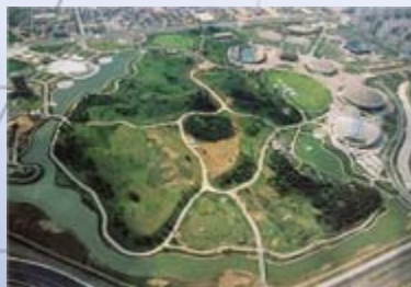
Baekje Ancient Tombs (2.0km)