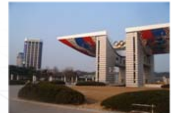
Olympic Park (1.0km)