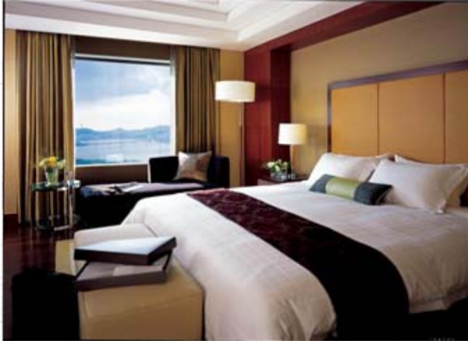
Deluxe Single Room