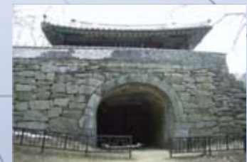
Namhan Mountain Fortress (9.0km)