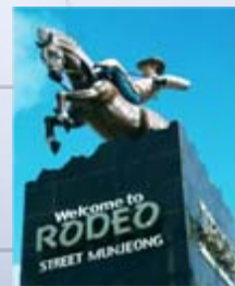
Moonjeong Rodeo Street (3.0km)