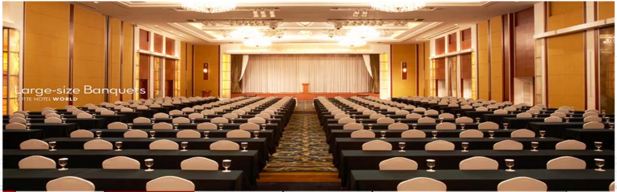
Large Size Banquet