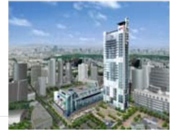
Techno Mart (2.5km)