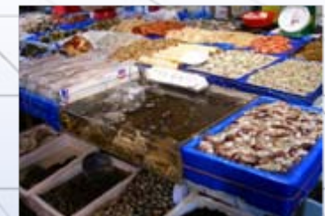
Garak Market (3.0km)