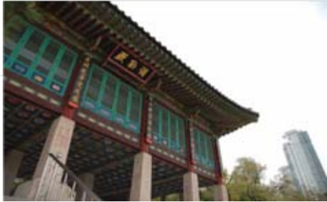
Bongeun Temple (4.5km)