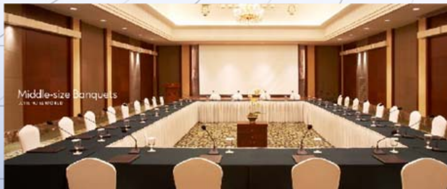
Middle size Banquet