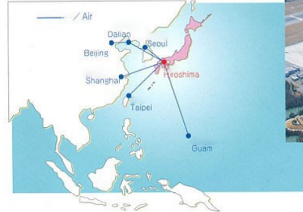
International Routes from Hiroshima

There are some direct flights to Hiroshima Airport from Korea, China, Singapore and Guam.