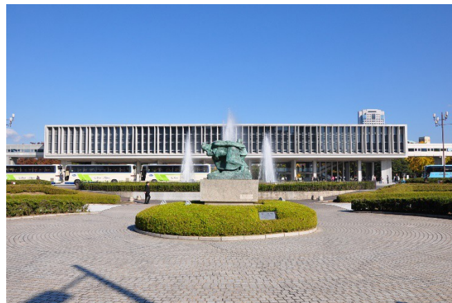
Hiroshima Peace Memorial Museum