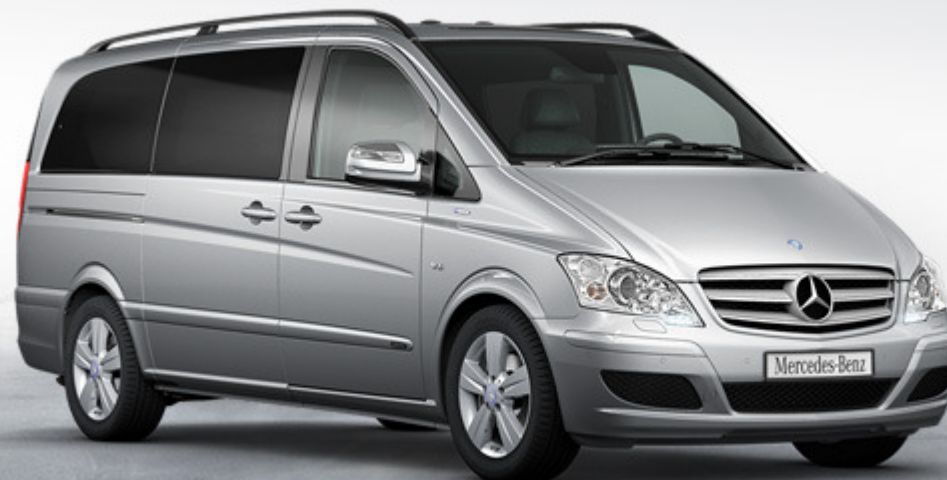
Mercedes Benz Viano