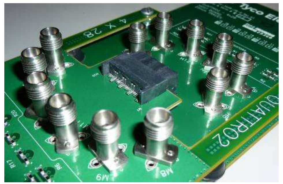
View from behind module plug All 8 differential pairs on top of module PCB

View from behind host board receptacle All 8 differential pairs exit from the rear of the receptacle connector