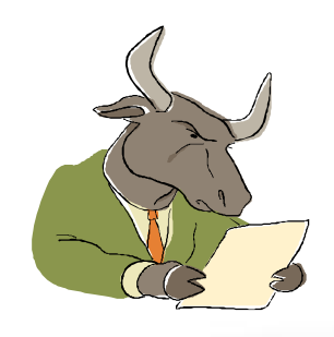
Broad Market Potential