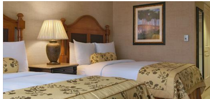
Fairmont Double/ double