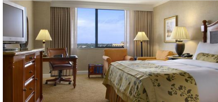
Fairmont King room