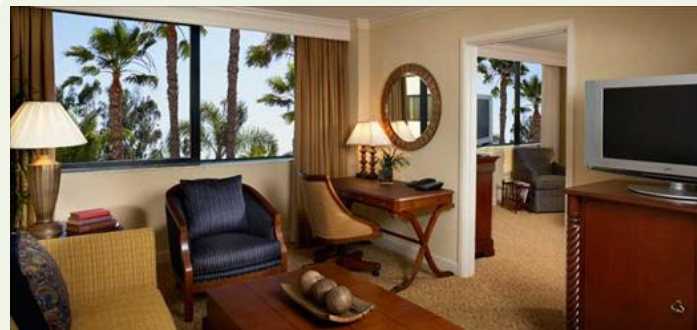
Executive suite, $224