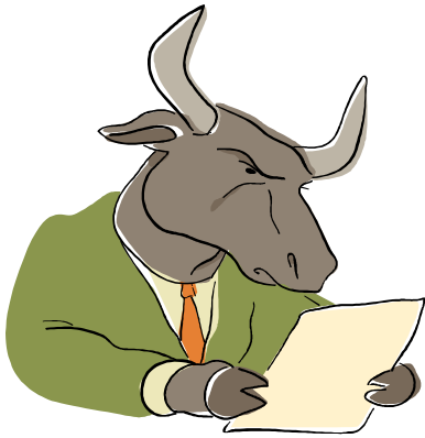
Broad Market Potential