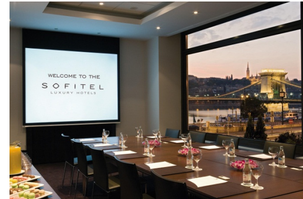
2 smaller meeting rooms