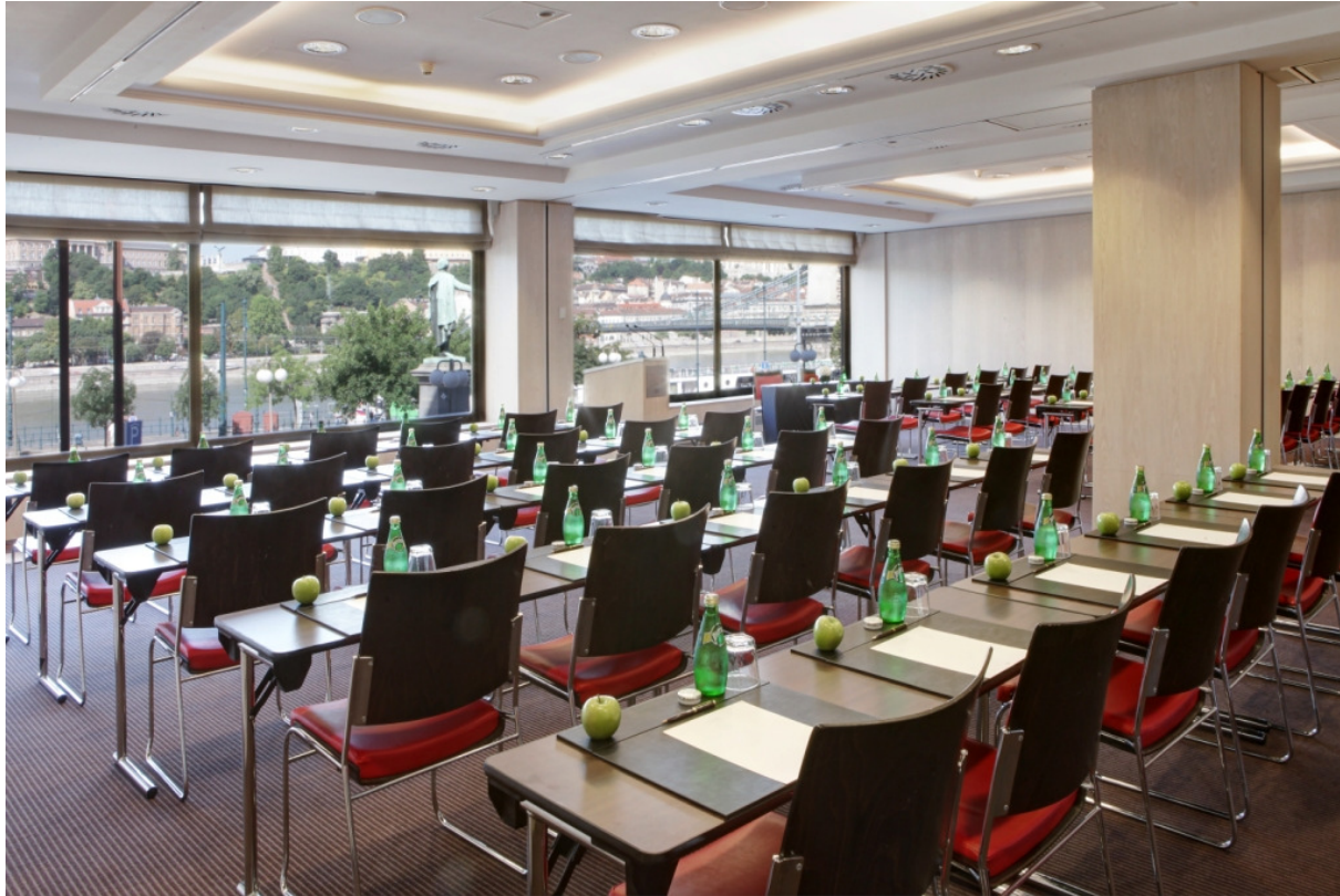
1 big meeting room for 80 people