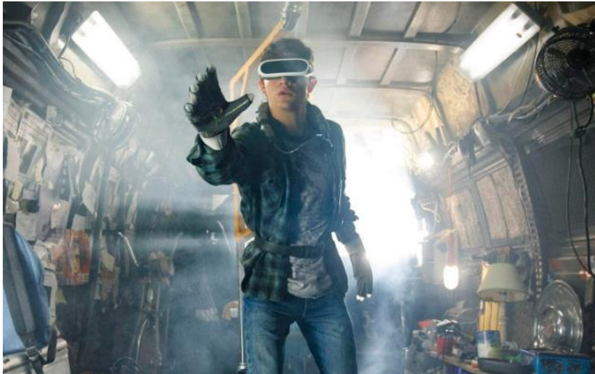
“Ready, Player one” 2018