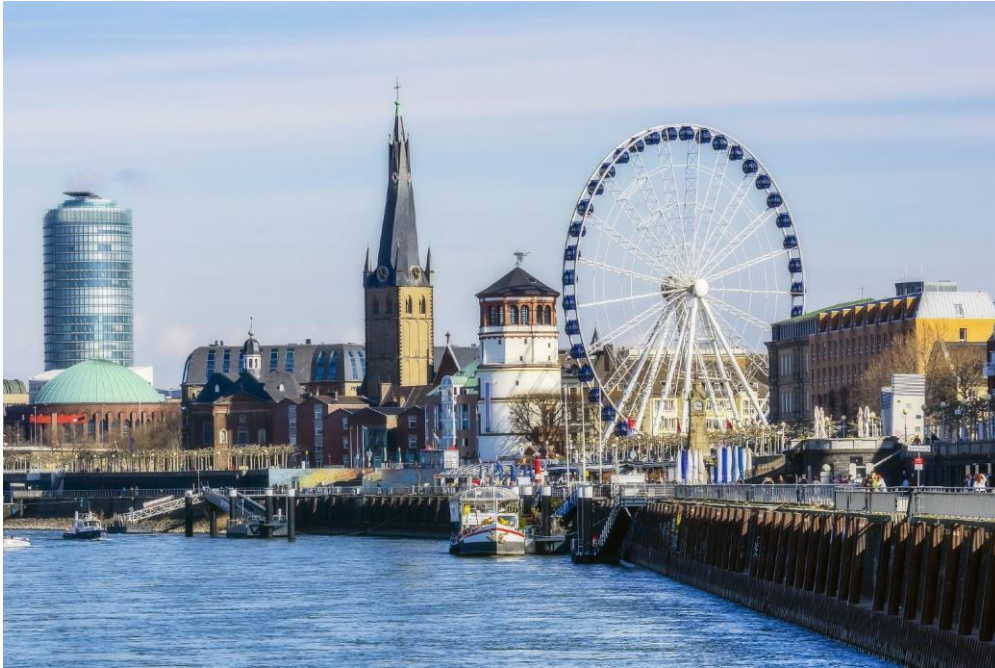
Rhine embankment promenade