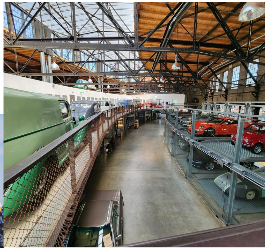
Classic Remise Düsseldorf