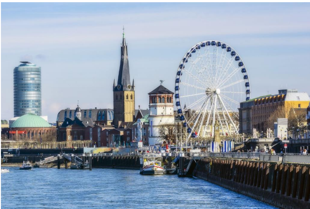
Rhine embankment promenade