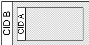
Figure 1: Example of a CID encapsulated packet

This contribution proposes to allow the encapsulation of CIDs for the relaying of packets, as in [1]. That is, if a packet is to be transmitted to an MS via an RS, the packet intended for the MS (with CID "A") becomes the payload of a second packet (with CID "B") intended for the RS. When the RS receives the data, it understands to only retransmit the embedded data, i.e. the original packet intended for the MS.