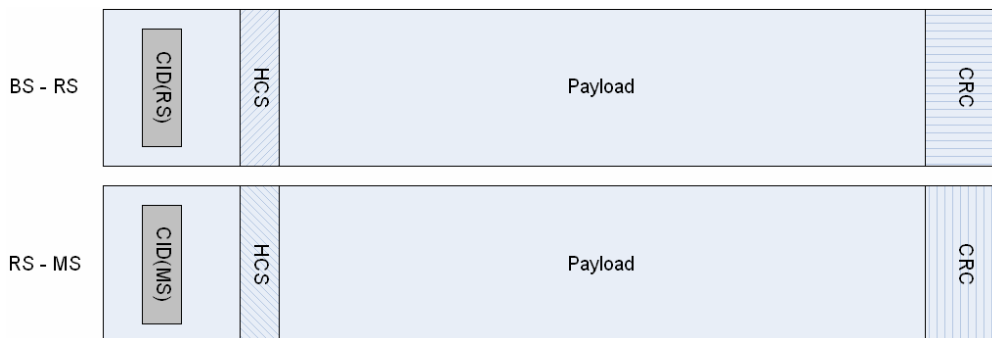
Figure 2. Cheating CID

Cheating CID is to change the CID of PDU. For example, in the case of Figure 1, a BS sends a PDU with CID of an RS to the RS. When the RS receive the PDU from a BS, an RS exchange the own CID with the one of an MS and sends the modified PDU to the MS. Finally, the MS receives the unique PDU. Figure 2 simply describes cheating CID.