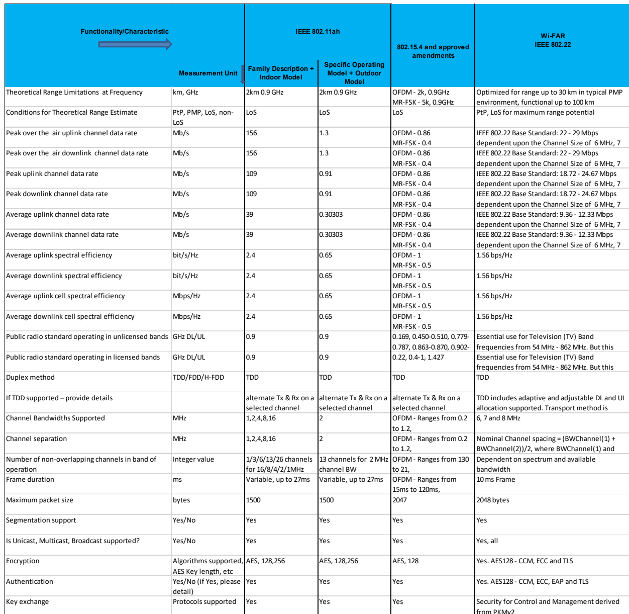
Figure 3 —Excerpt from SGIP PAP 2 Wireless Characteristics Matrix for standards operating in sub-1 GHz spectrum