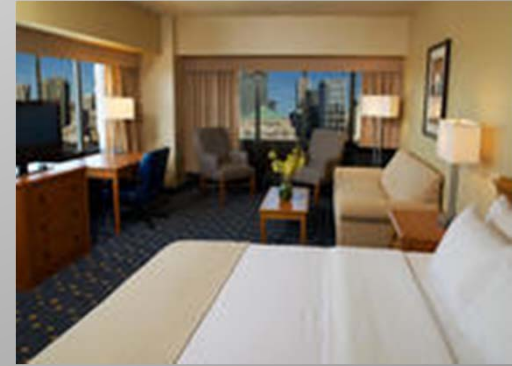
King executive room $239, corner location