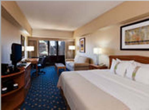
King room with view