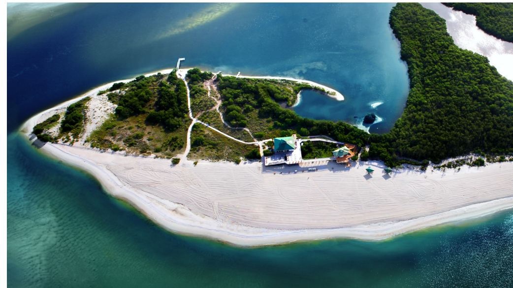
Private Beach on Estero Bay

NEC America to provide meeting management services, IT, AV, Continental Breakfast, am and pm coffee breaks and one evening social event.